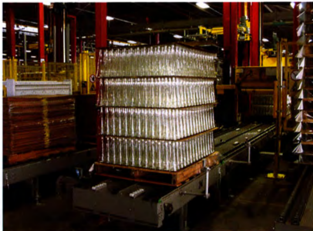
Nampak Wiegand Glass uses cold end equipment from MSK at its Roodekop plant. ▶

Operation of the machines is simplified by the integrated software system MSK EMSY.