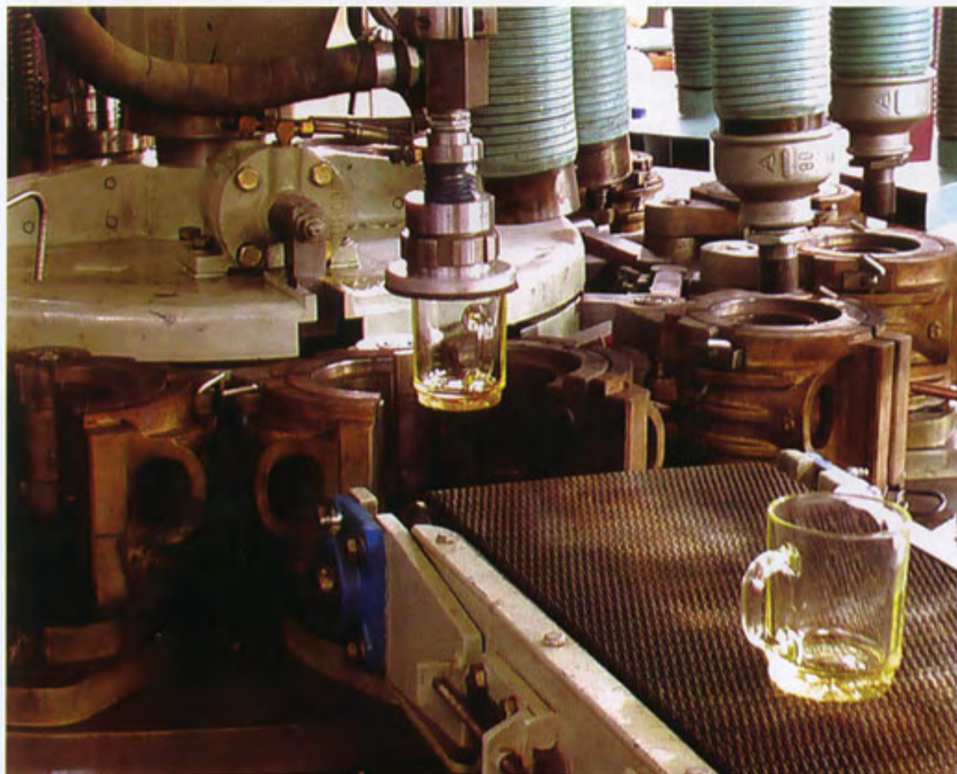
A press line from MAVSA at Egyptian glassmaker Cleopatra Glass Co SAE's tableware production facility.

A MAVSA press line successfully entered production at the tableware production facility of Cleopatra Glass Co SAE in Egypt at the